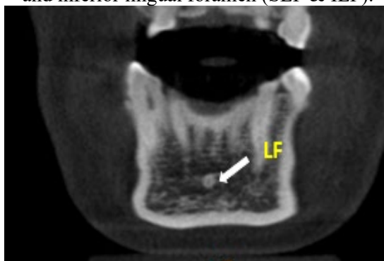
Figure 4: Lingual foramen (LF) coronal CBCT imaging.