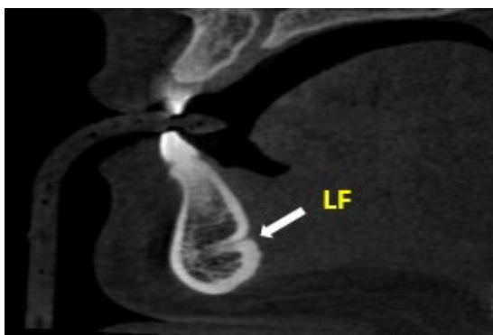
Figure 1: Sagittal plane of CBCT showed lingual foramen (LF).

possessed foramina. Alqutaibi et al. (Alqutaibi et al., 2022) have indicated no significant difference between genders in the prevalence of LF. A review by Barbosa et al. (Barbosa et al., 2020) concluded that females were more likely to have it than males. While research by de Andrade Santos et al. (de Andrade Santos et al., 2020) in 2020 found that both men and women had foramina (99.0% and 99.5%, respectively). LF is quite prevalent, and its occurrence has been found to be independent of factors including age, gender, and dental state.