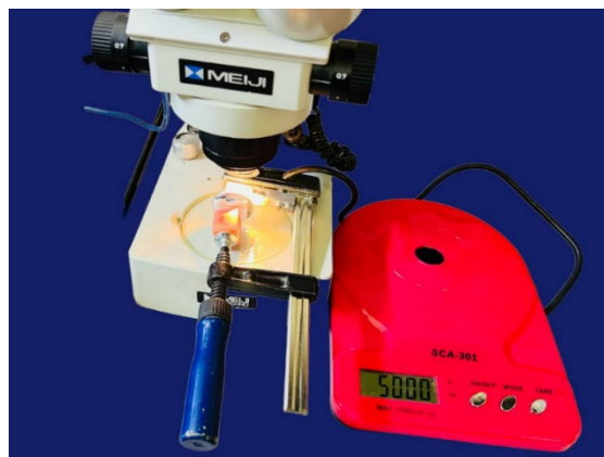
Figure 5: Stereo-zoom microscope with specimen holding device that was particularly constructed to maintain a constant pressure of (5N)

Twelve measurements were obtained from each crown achieved by the same observer to avoid errors. The average of each three points of one surface was taken and then the average of the four surfaces was selected to represent the marginal gap of that sample.