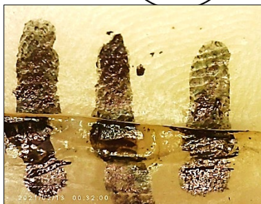
Figure 4: Three points for marginal gap measurement