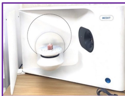
Figure 2: Scanning of the tooth by Medit T710 in-lab scanner