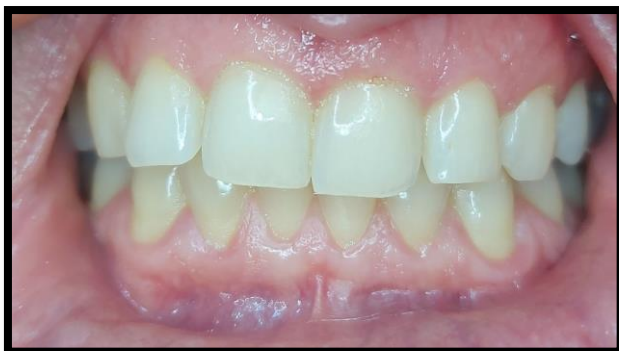
Figure 1: according to visual examination method; the marginal gingiva look flat, with square crown, it means a thick gingival biotype.