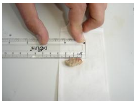
The stone after removal