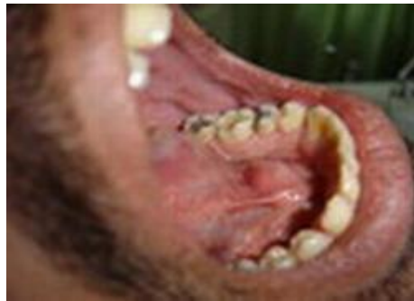
Intra oral photograph shows the position of the stone