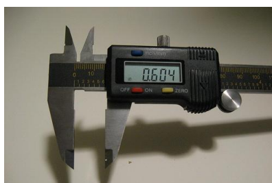
Figure (4): Digital vernier caliper