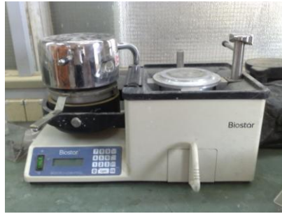
Figure (1): Biostar device used for fabrication of flexible mouth guard.