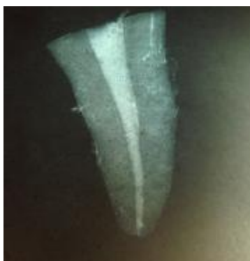
Fig.1: Radiographic evaluation

of root canal sealers. Indian J Dent Res. 2002; 13(1):31-6.