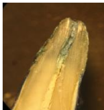
Fig.2: Score 3- Stereomicroscopic evaluation