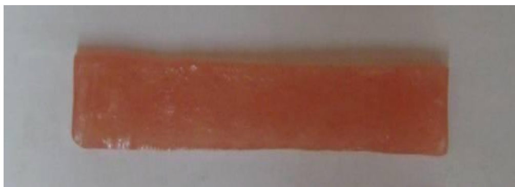
Figure (1): Acrylic pattern for transverse strength test.