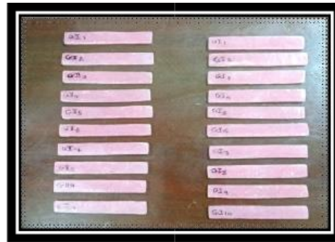
Figure (2): Samples for study Control and experimental groups.