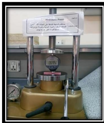
Figure (4): Sample under surface hardness test.