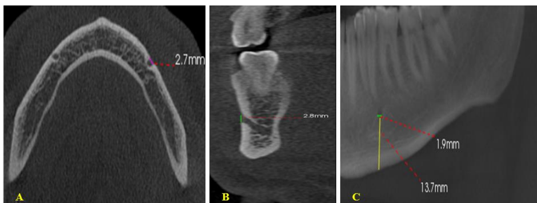
Figure 2. A. The horizontal dimension (represented by the purple line) of the mental foramen in an axial plane, B. The cross-sectional image displays the vertical dimension of the mental foramen, as indicated by the green line; C. Width and distance of the mental foramen from the inferior border of the mandible display by sagittal plane.