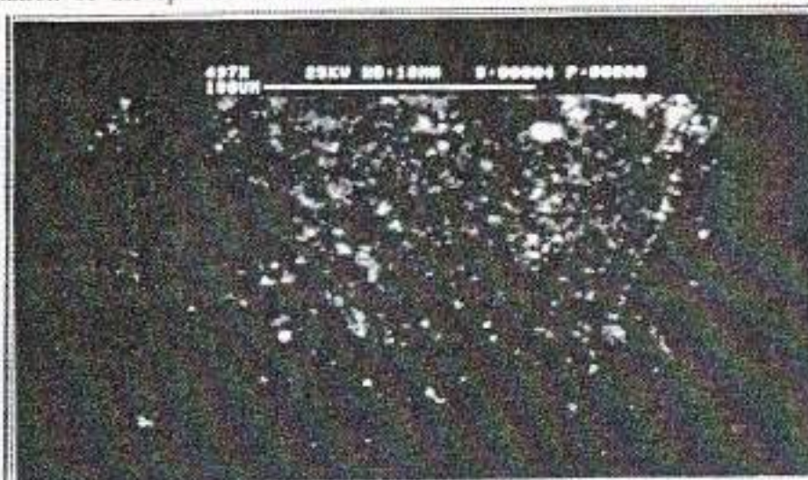
(a) Non-polished Ormocers aged in ethanol 50%.

ethanol revealed no different storage media with no cracks formation (fig3).