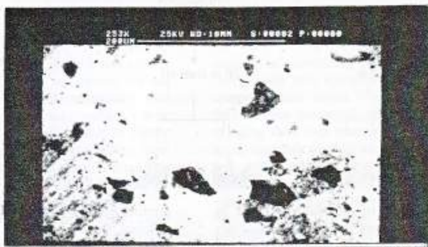
(a) Non-polished Ormocers aged in D.W. for 14 days

polished & non polished Ormocers (fig 1).