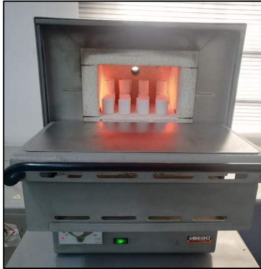
Figure 1: Investment specimens heated using model drying oven