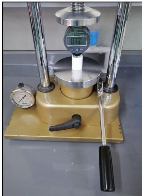
Figure 2: Investment specimen under surface hardness Shore D durometer unit