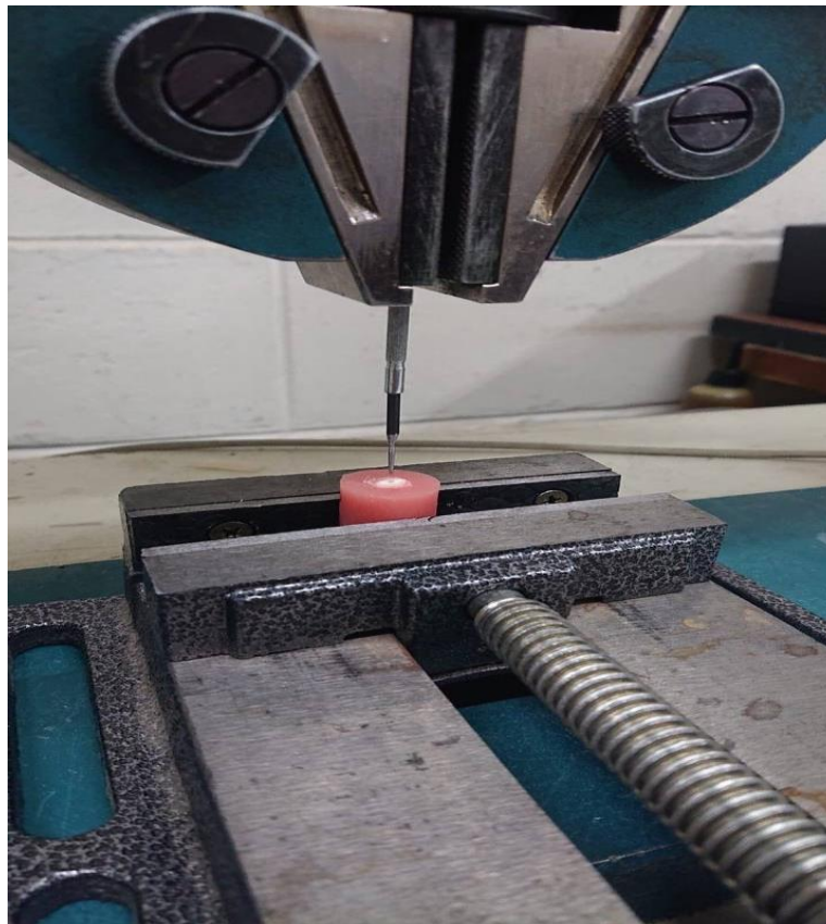
Figure1 : universal test machine (model H50KT, England)