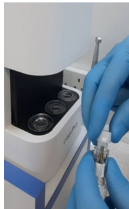
Figure 5: CORE Plasma activator device for plasma surface treatment of Ti-abutment.