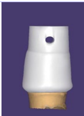
Figure 2: Design of zirconia crown