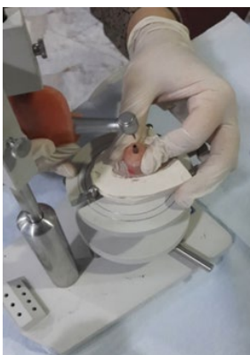
Figure 3: Bur surface treatment for Ti-abutment