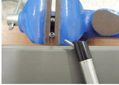
Figure 4: Sandblast surface treatment for Ti-abutment